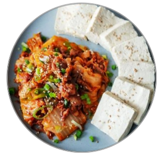
두부김치 | DUBU KIMCHI

Stir-Fried Kimchi Served with Sliced Warm Tofu