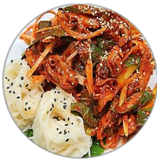
골뱅이무침소면 | GOLBAENGII MUCHIM SOMYUN

Spicy Seasoned Moon Snails Served with Noodles