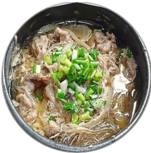
푹배기불고기 | TTUKBAEKI BULGOGI

Marinated Bulgogi Beef Soup in Savory-Sweet Soy-Based Sauce