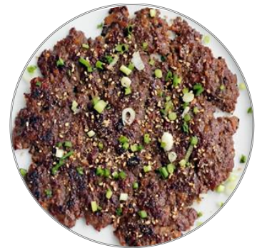
바삭불고기 | BASSAC BULGOGI