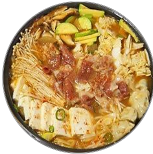
차돌된장전골 | CHADOL DOENJANG JEONGOL

Thinly Sliced Beef Brisket, Vegetables, and Tofu in Fermented Soybean Paste Broth